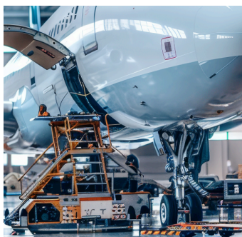
AEROSPACE & DEFENSE