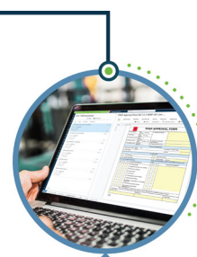
APQP / PPAP